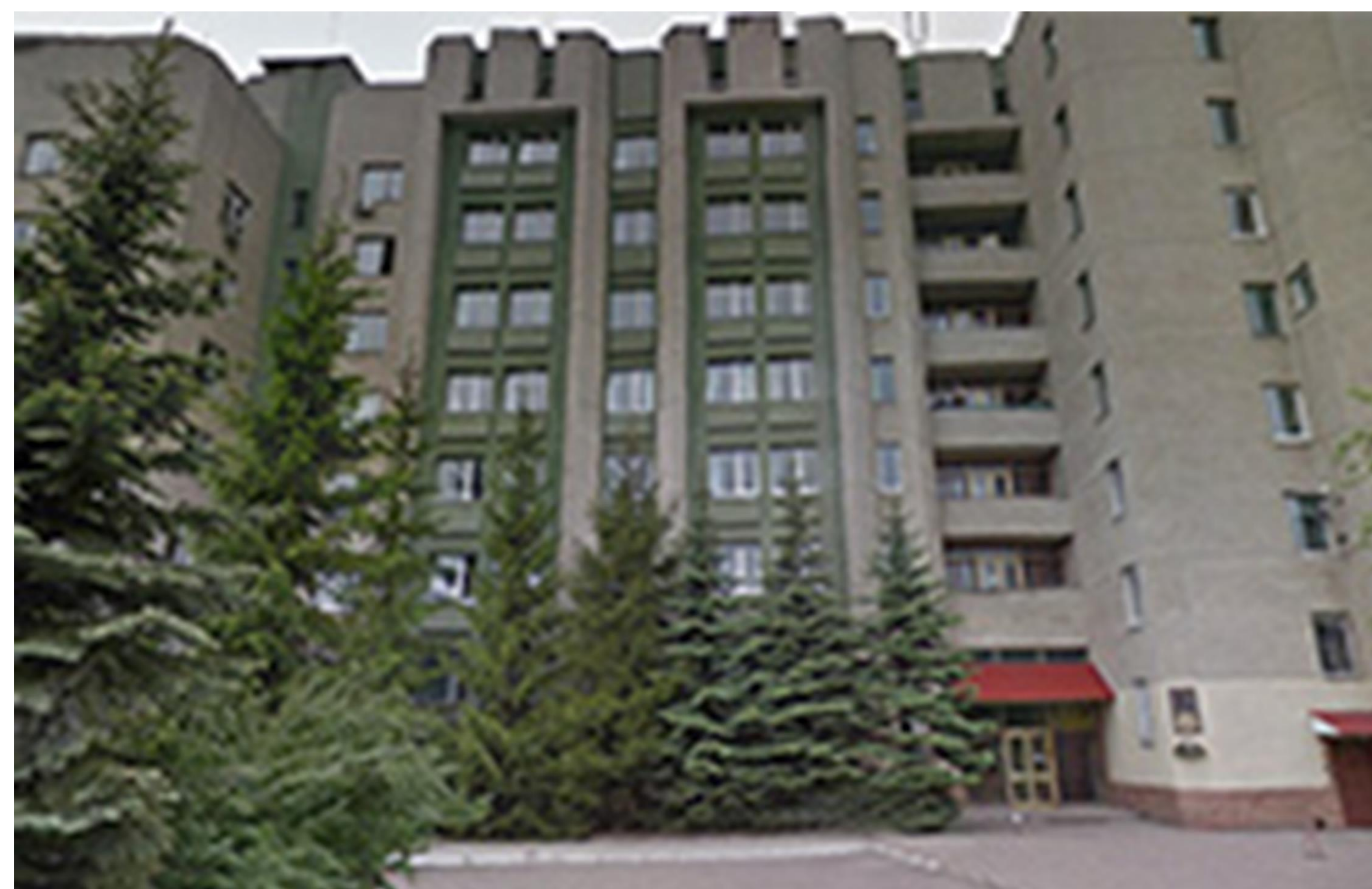
Institute for Regional Research M.I. Dolizni NAN of Ukraine , Kozelnycka 4 Street Senate Hall